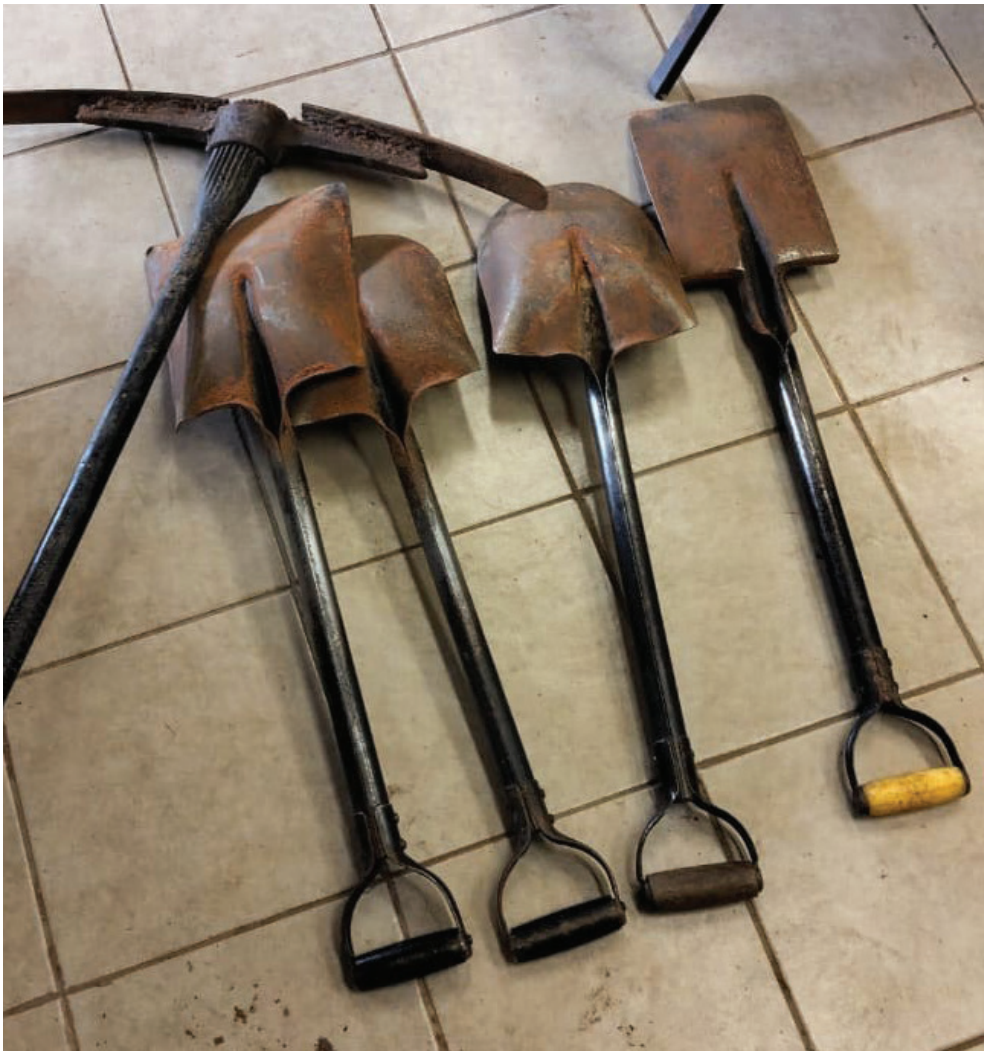
The shovels and a pick that were confiscated by the police when arresting the illegal sand miner

"The South African Police Service will continue to take decisive action against criminals involved in illegal mining activities, aiming to eradicate such crimes and contribute to the creation of a crime-free society. The suspects will appear soon in their local magistrate courts respectively," concluded Thakeng.