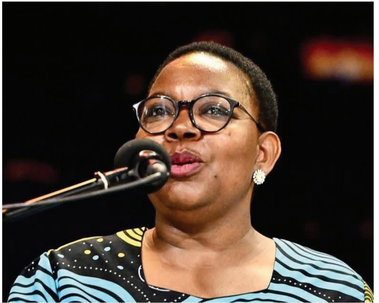
MEC for Health in Limpopo, Mavhungu Lerule-Ramakhanya, says she is impressed with the historic 2024 matric pass rate in the provinces.