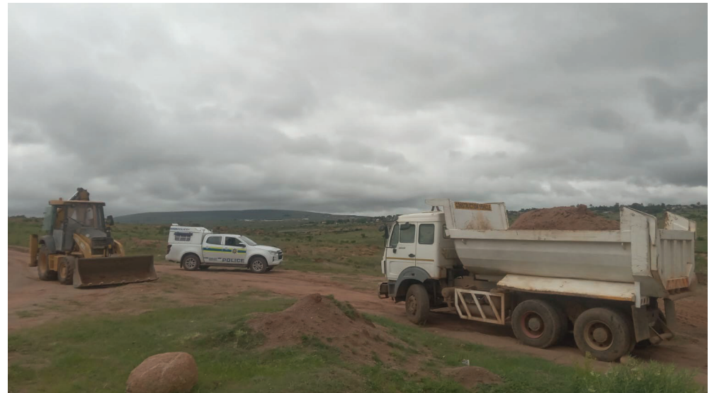
The sand mining at Rameleteng in Dennilton where a 42-year-old man was apprehended by the police for illegal mining.