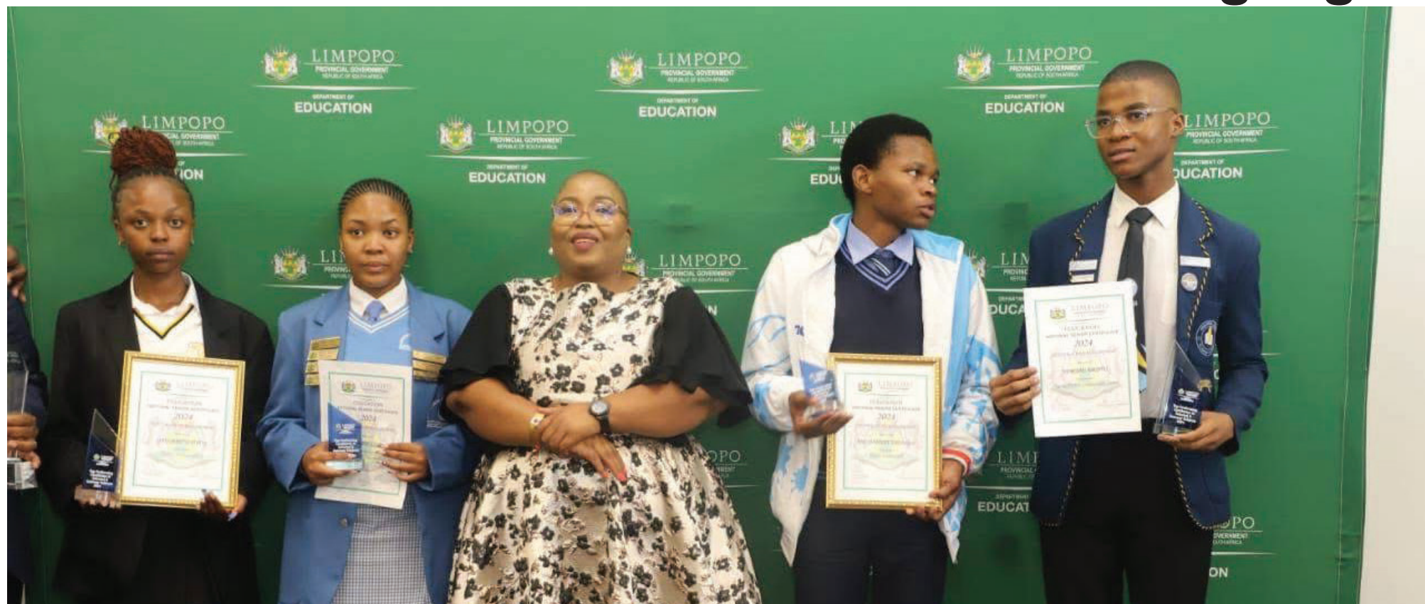
Some of the top achieving learners from Sekhukhune district with Executive Mayor, Minah Bahula at the Ranch Hotel outside Polokwane.

SEKHUKHUNE - Several 2024 matriculants from Sekhukhune district made the region proud with their outstanding achievements.