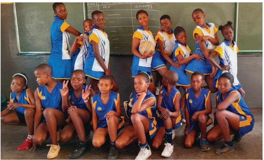
Reakgona NC that defeated their opponent, Proudly Angels NC with a heavy 63-5 score at Rovers Sports Grounds in Tafelkop.