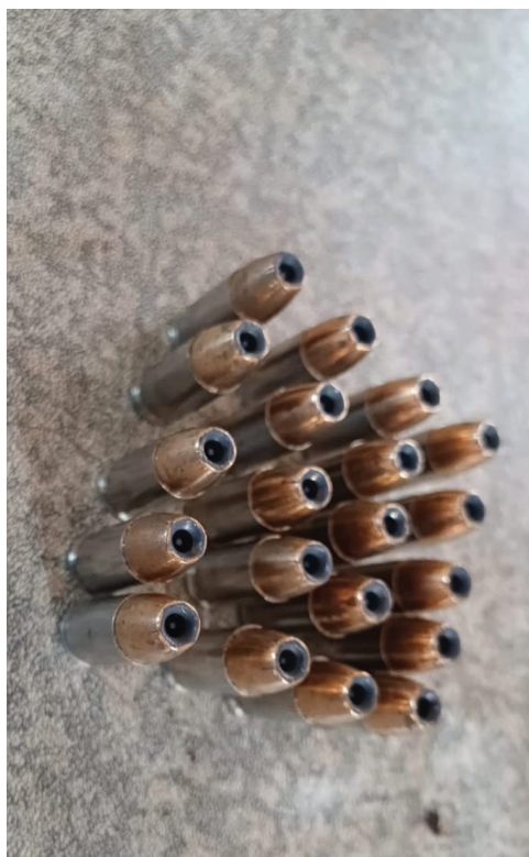
The ammunition, including special rounds, were recovered in possession of the suspect when he was arrested at Thabampye Village in Ga-Masemola.