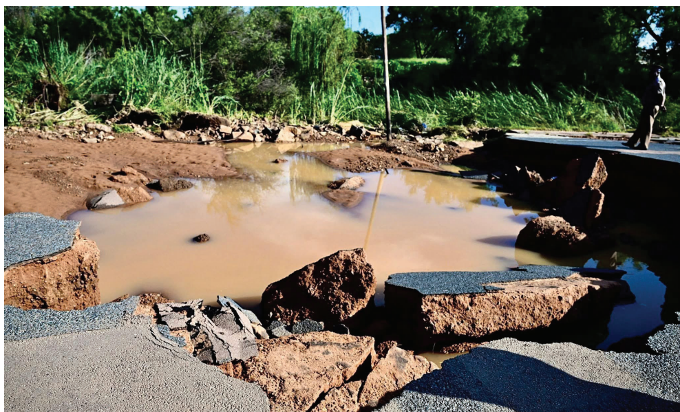
R33 Road bridge, approximately 30km from Vaalwater within the Waterberg district, which was recently submerged in water.

conduct assessments across the entire province. Waterberg district is the heavily affected in the province. Ramathuba urged residents to stay alert and avoid driving and crossing rivers that are overflowing. She reaffirmed the government's commitment to addressing the damage. "We shall use the available capacity within public works to make the interventions on roads and bridges that have been swept away whilst the Department of Social Development will be dealing with affected families," remarked Ramathuba.