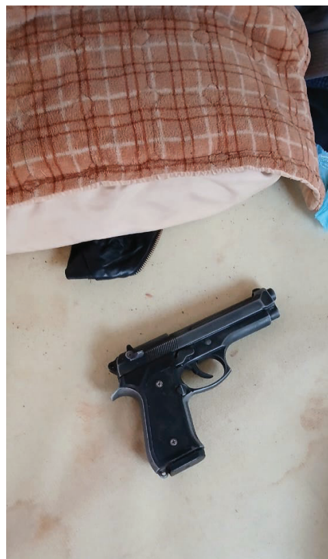
The unlicensed firearms that were found in possession of the suspect during his arrest.